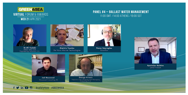
GREEN4SEA Virtual Forum Panel no. 4

The complete panel discussion is available on Youtube.