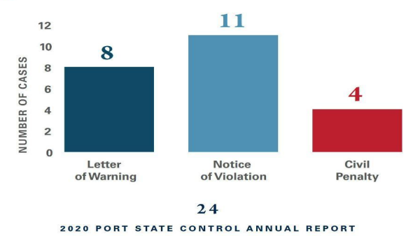
USCG Annual Report: BWM Deficiencies in Brief