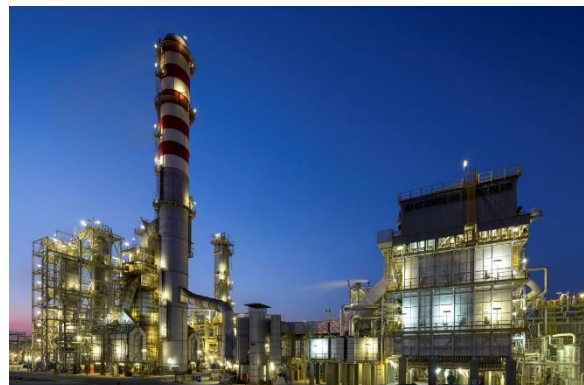
Motor Oil (Hellas) Hydrogen Production Unit