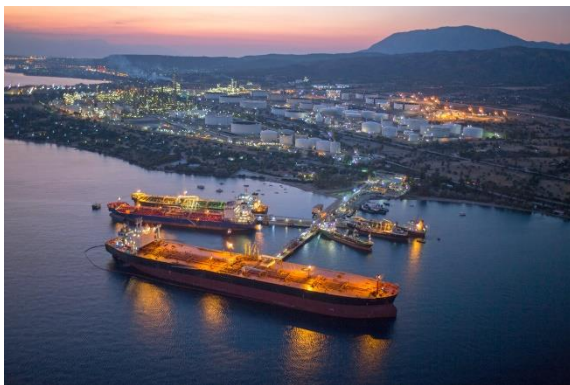
Motor Oil (Hellas) Industrial Plant

The Pilot Unit in MOTOR OIL's Petroleum Refinery will be installed next to its Hydrogen Production Unit. This Unit is producing hydrogen through stream reforming of either natural gas, liquefied petroleum gas or naphtha. Its design production capacity is 65.000 Nm 3 /h H 2 with a purity of at least 99.9% vol. The flue gases of the Hydrogen Production Unit contain on average 17% vol CO 2 with a flow rate of 160.000 Nm 3 /hour. The Carbon Capture demonstrator will have a capturing capacity of 350 tonnes CO 2 /year. The CARMOF Pilot Unit will be built in line with EU safety recommendations and MOTOR OIL's Health, Safety and Environment requirements (lead partner: SUK, Greece). Its sensing and automation will allow its complete control and remote monitoring (lead partner: 6TMIC Ingénieries, France).