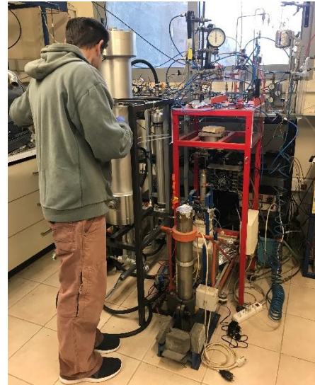
Testing of the membrane module for CO 2 capture from flue gas at DEMOKRITOS and SUK facilities