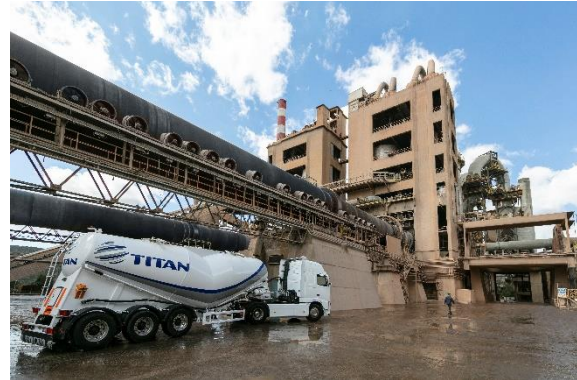
Titan Cement Group, Kamari Cement Plant