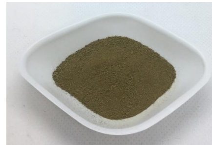
CPO-27(Ni) MOF powder developed in the CARMOF project and now commercially available from Promethean Particles