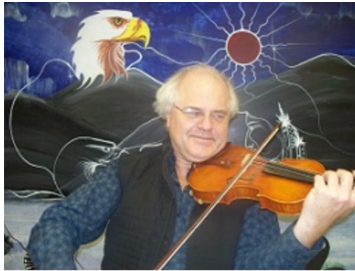
(Artwork with permission of Chandler McLeod)