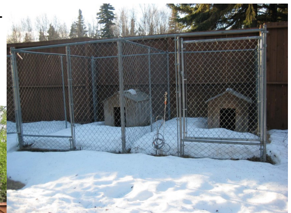
( Top Left) Kennels in 2005. (Right) The Kennels this past winter. (Bottom left) The New Kennel in progress.

Kennel Club, and RedRover.org we were able to build a new outdoor ken-