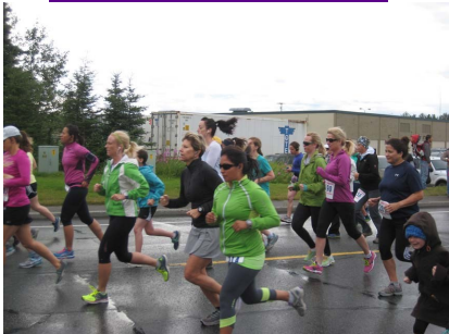
2014 Run for Women

Come and support our efforts in the Race to End Violence. Volunteers are also needed, call 283-9479.