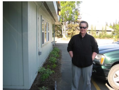
(top) Volunteers dedicated to expanding their understanding of domestic violence and sexual assault and the resources available in this area at our Community Awareness Workshop.