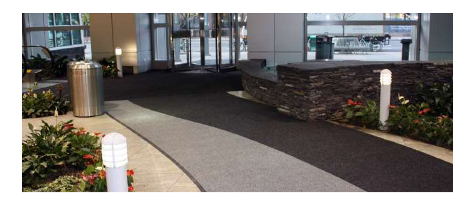
Custom Matting is one of our specialties