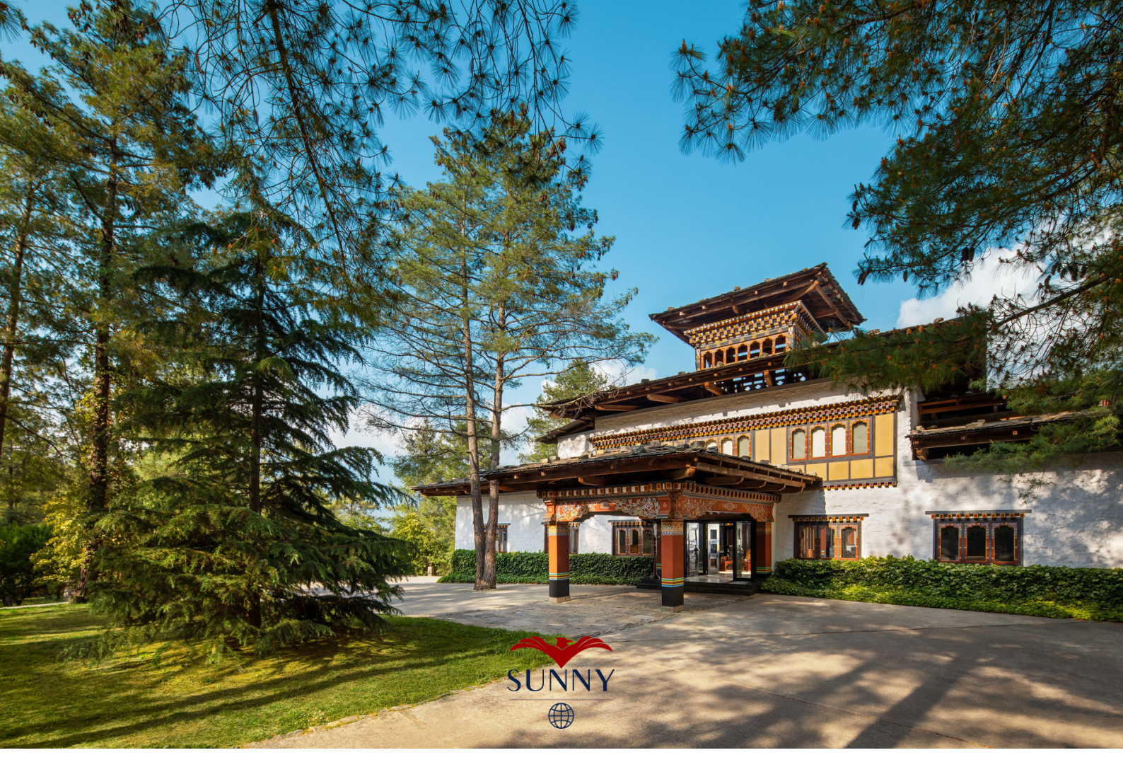
31st October 2024 - Day 6: Punakha to Paro (5 Hrs).