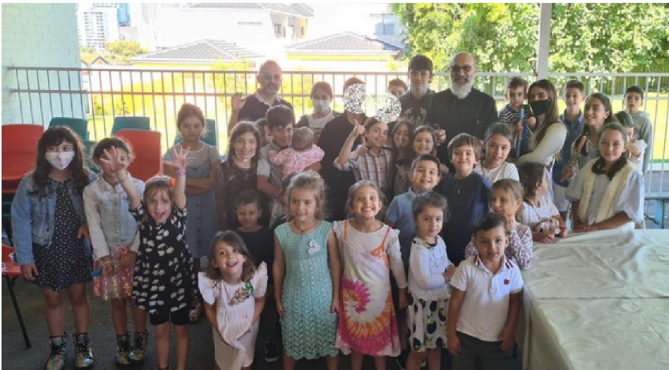
Celebrating Easter at the Evangelismos' premises