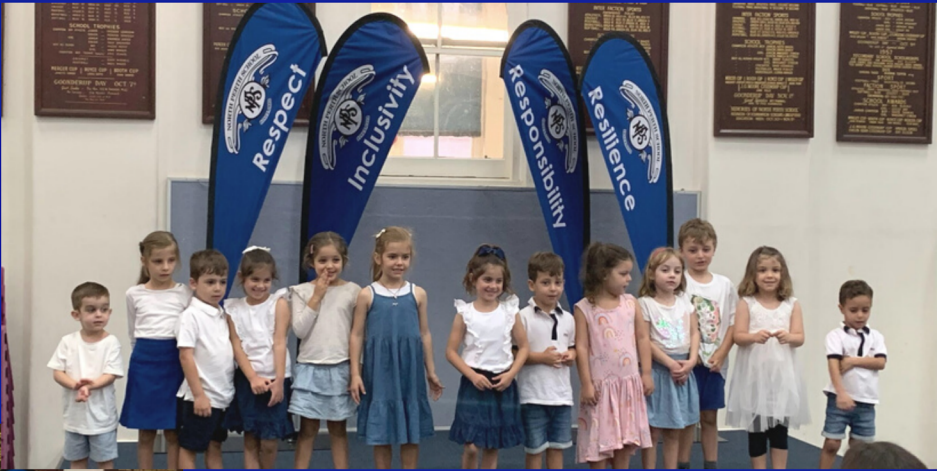
25th of March Celebration at North Perth Primary School