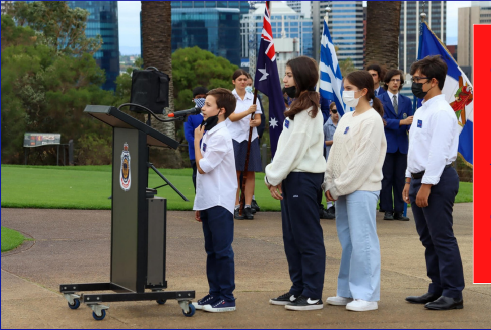
GLCI students reciting the poem "Νίκη" (Victory) by Kostis Palamas at the Kings Park War Memorial for the 25th of March National Day Celebration organised by the Greek Consulate in Perth.