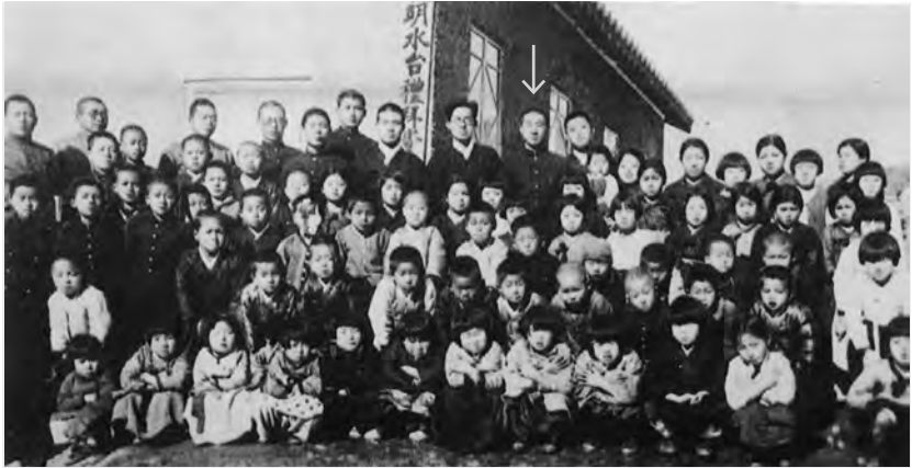
I taught Sunday School at the Myungsudae Jesus Church in Seoul in the early 1940s. I am standing in the back row (see arrow ).