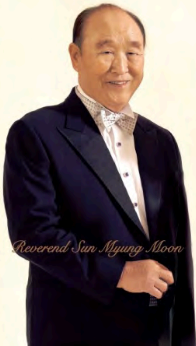
Reverend Sun Myung Moon