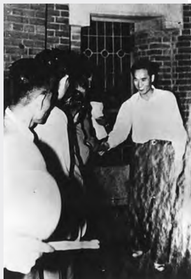
Right: I was greeted by our members after my release from Seodaemun Prison in Seoul on October 4, 1955. I was indicted for “draft evasion” even though I had been in a North Korean prison camp during the war. I was declared innocent after serving three months in jail.