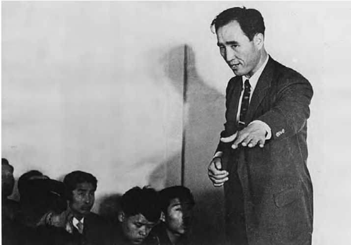
Teaching members in our church in Cheongpa-Dong right after coming out of Seodaemun Prison.