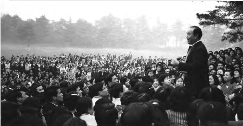
In 1969, during my second world tour. The movement in Japan had grown enormously, and our meetings had to be held in large outdoor venues like this park in suburban Tokyo.