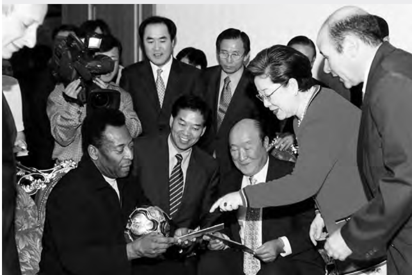
On June 4, 2002, soccer great Pelé paid a courtesy visit to my residence in Hannam-Dong. Here my wife explains the World Peace Cup Soccer Tournament. I shared with Pelé the vision of promoting soccer as a way to build bridges of peace between nations.