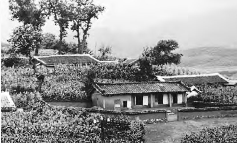
The home in North Korea where I was born. It originally had a small wing on each end, but now, only the main building remains.