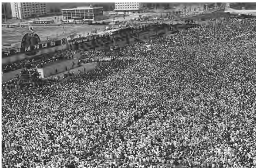
More than 1.2 million people attended the World Freedom Rally in Seoul's Yoido Plaza on June 7, 1975.