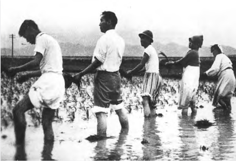
Early spring 1959 in Yamok, Kyeonggi Province. I took the members to help plant rice. The farmers benefitted, and for us it was training.