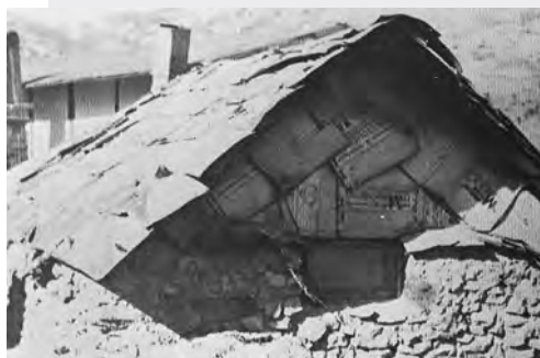
Above: The mud-walled hut that Won Pil Kim and I built in early 1951 out of ration cartons stood on a lonely hill by a cemetery in Busan.