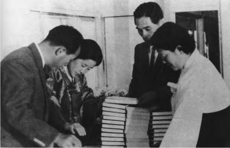
On May 1, 1966, the 12th anniversary of the founding of the Unification Church, I signed copies of the Korean-language second edition of my teachings, the Divine Principle . I am on the left.