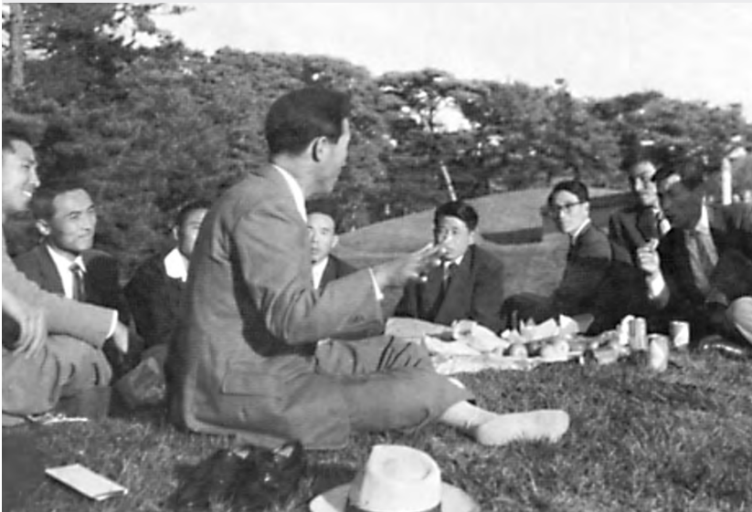
We often went outdoors in the Seoul area, where I would teach the members about God's Providence.