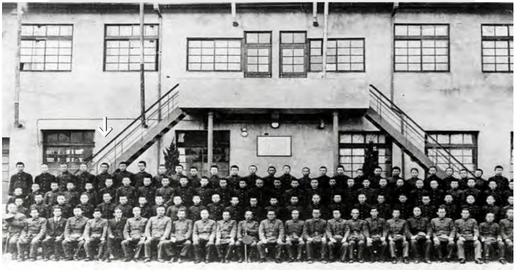
March 8, 1941. Commencement ceremony of the third graduating class of Kyeongsung School of Commerce and Technology. I am in the back row, fifth from the left (see arrow ).