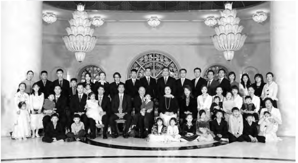
Even this family portrait taken in Korea on January 1, 2009, doesn't include everyone. We have 14 children, living in different parts of the world, and an ever-growing number of grandchildren and great-grandchildren.