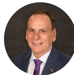
Mayor Kevin Hartke (Ex-Officio)