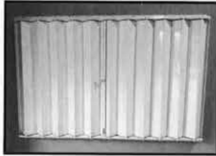
Easy Open/Close Accordion Shutters