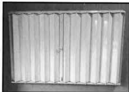
Easy Open/Close Accordion Shutters