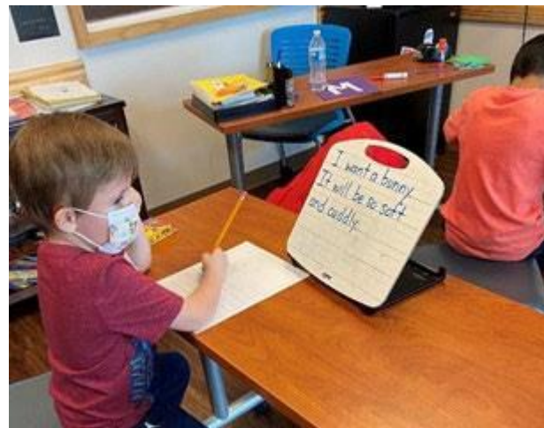
Pediatric Patients continuing education in the CUANM Connected Academy at UNM Children's Hospital

Moving forward we are looking for support to hire additional licensed teachers to fully staff our district needs.