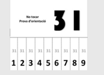
Figure 2: Control code and cut-out score strips At the end of the game, we count the points obtained.

We start the activity en masse, but we let them visualise the map beforehand so that they can choose a strategy. We emphasise the importance of arriving at the checkpoints as soon as possible.