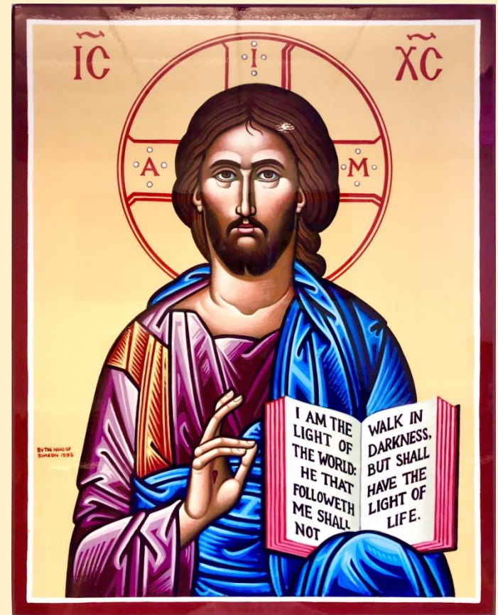
Icon in St. Thomas' worship space.

Our Father, who art in heaven, hallowed be thy Name, thy kingdom come, thy will be done, on earth as it is in heaven. Give us this day our daily bread. And forgive us our trespasses, as we forgive those who trespass against us. And lead us not into temptation, but deliver us from evil. For thine is the kingdom, and the power, and the glory, for ever and ever. Amen.