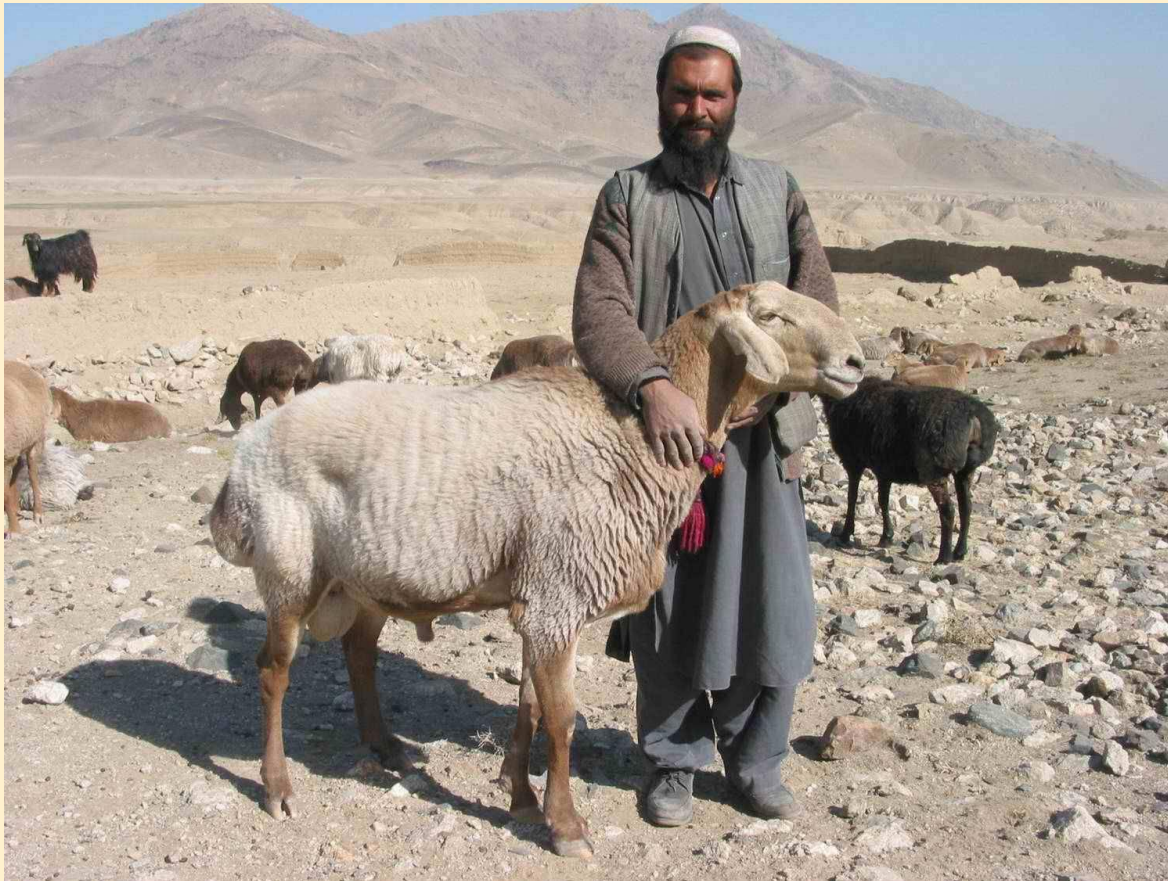
shepherd in Afghanistan with fat-tailed sheep