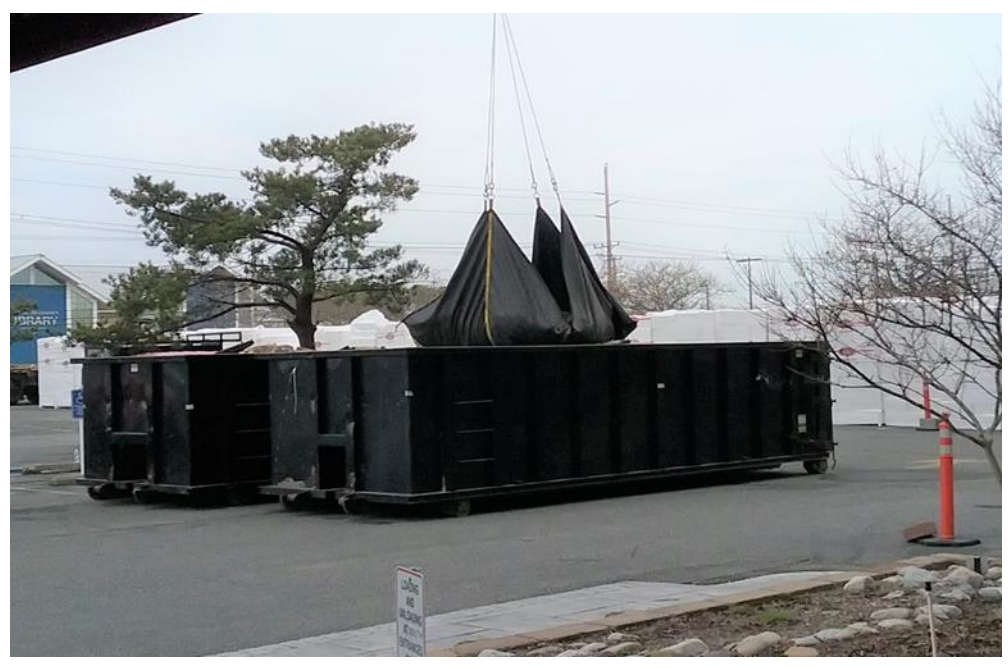
The workers began by removing the old stones and two layers of old roofing dating back to 1974.