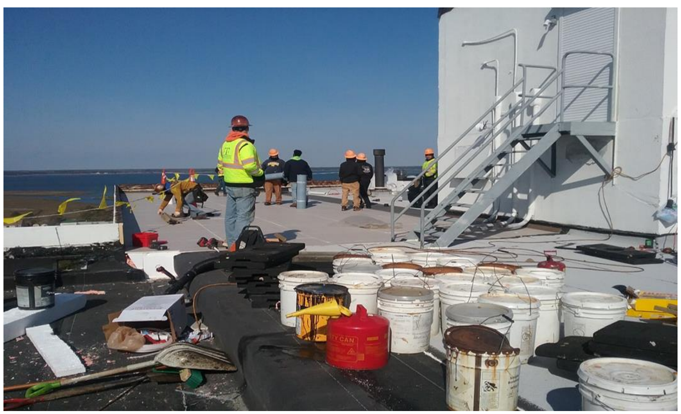
Once the blocks were in place, the final roofing materials were installed.