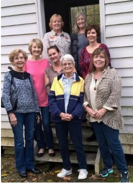
Pond Springs Plantation outside of Decatur, AL (above) Dismals Canyon (below)