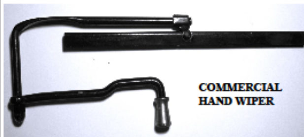
COMMERCIAL HAND WIPER

There are three types of windshield wipers used on Model A Fords. Hand wipers, a carryover from the 26/27 Model T made by Ford and Trico, were standard on all open vehicles until October 1928 and on commercial vehicles until April 1930. The operating arms on each were of different length—6 3/8 and 5 5/8 inches respectively. There were lots of other hand wipers used on other cars so measure first before you buy.