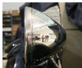
Acorn shaped head lamp

Cowl lamps were introduced in 1929 and had an acorn shape as well and were bright nickel plated as well. Plating in late 1929 was changed to match the change made with the head lamps. They were standard equipment on Cabriolets, Town Sedans and Town Cars. The shape was changed in 1930-1931 models to reflect the shape of the head lamp and were stainless steel with chrome plated arms. They were standard equipment on deluxe models and offered as accessories on other models.