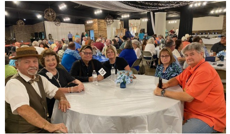
Thursday Night Welcome Dinner