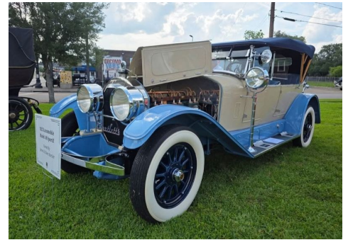
Above: 1925 Locomobile