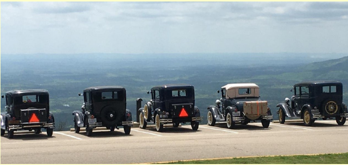
AT QUEEN WILHELMINA LODGE