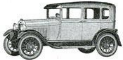
NEW FORD SEDAN A big money car. Wide body. Curvature throughout. Front and rear. Four convenient doors. Unusually large windows. Rich upholstery and full-riveted hardware. Great light. Your choice of four artistic colors. $570 (F. O. & Donald)