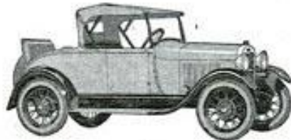
NEW FORD ROADSTER A long, low, cheery car, the best in its class. Wide doors, deep cushions, rich upholstery. Full-riveted hardware. Double seat optional. Your choice of four beautiful color combinations. $385 (F. O. & Donald)