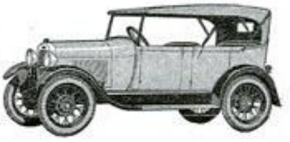
NEW FORD PRAMTON Available only in some areas. All four doors open forward. Curvature over and over with doors. Fully riveted body. Unusually large windows. Your choice of four artistic colors. $395 (F. O. & Donald)