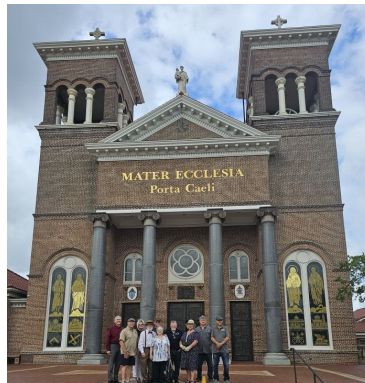
The Basilica was completed in 1907 at a cost of $60,000. There are only four Basilicas in Texas. It was beautiful!