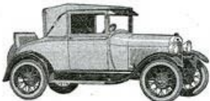
NEW FORD SPORT COUPE Combines the great appearance of the roadster and the advantages of a closed car. Double seat optional. Standard in four artistic color combinations. $550 (F. O. & Donald)