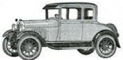
NEW FORD COUPE There is a bit of the European touch in the overhang and contour of this new Ford Coupe. Handy package deal in back of seat and unusually large water-proof luggage space in rear deck. Your choice of four beautiful colors. $495 (F. O. & Donald)