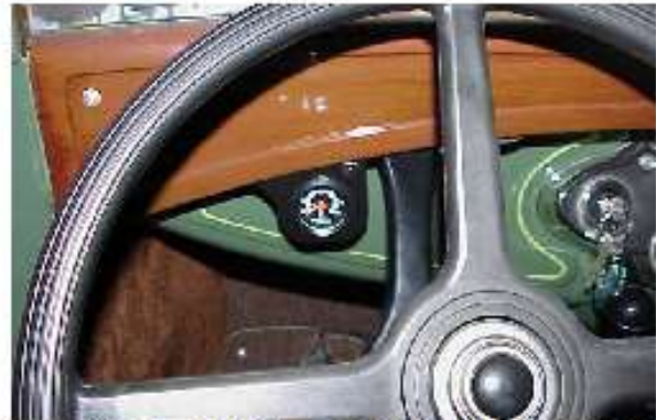
A 1½-inch SunPro mechanical temperature gauge is installed with a custom made bracket up under the dash rail of a 1931 Victoria.

It is also a good idea to install a thermostat in the water system. Most Model A suppliers carry them. They come in 160° and 180° temperatures and mount inside the water hose just above the water outlet casting on top of the head. The thermostat will bring the water temperature up to the proper operational temperature (either 160° or 180°) quickly and will maintain it there. ☺