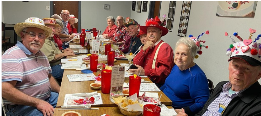
Ladies Valentine Hat Winners

Since the monthly meeting fell on the 14th, members were encouraged to decorate and wear a Valentine hat to the meeting. Twelve members made hats and wore them. Everyone present voted by secret ballot for the best men and ladies Valentine hats.