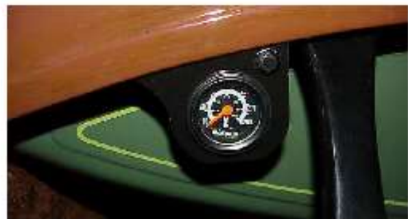
The little switch in the upper right corner of the bracket is a momentary push button switch wired to the ammeter that will give you a quick peek at the gauge while driving at night.