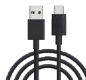
Type-C Charging Cable