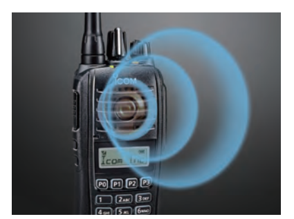
1500 mW powerful audio