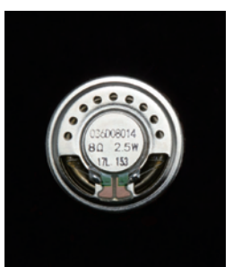
Icom custom high power handling capacity speaker