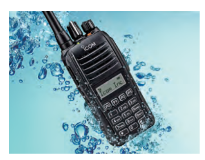
Waterproof for 30 minutes at one meter