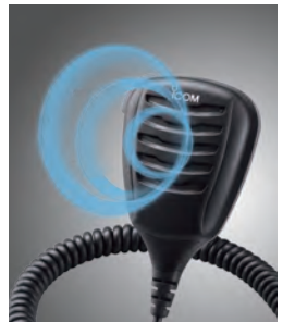
1500 mW powerful audio with optional HM-222HLWP