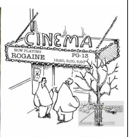
"It's the sequel to 'Hair'."

This is the story of four people named Everybody, Somebody, Anybody, and Nobody. There was an important job to be done and Everybody was asked to do it. Anybody could have done it, but Nobody did it. Somebody got angry about that, because it was Everybody's job. Everybody thought Anybody could do it, but Nobody realized that Everybody wouldn't do it. Consequently, it wound up that Nobody told Anybody, so Everybody blamed Somebody.