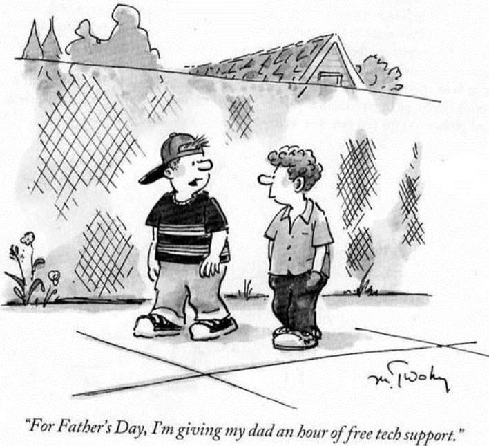
"For Father's Day, I'm giving my dad an hour of free tech support."