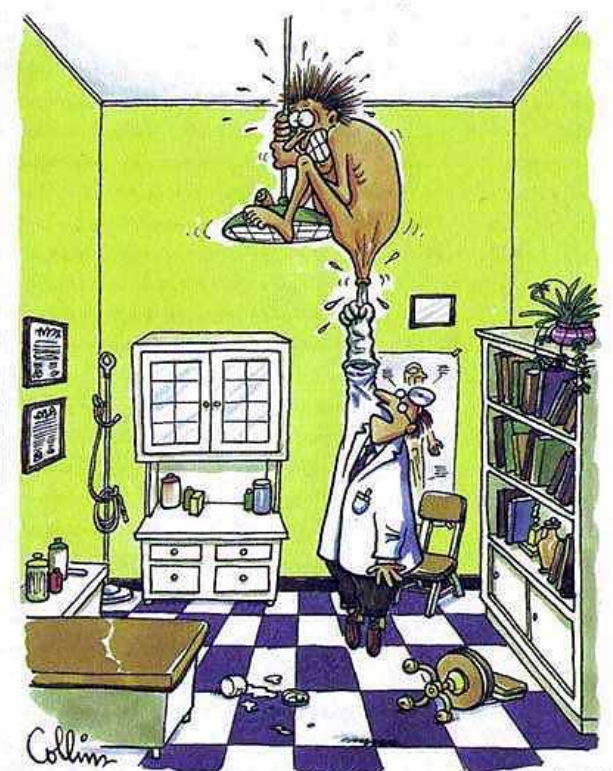
"Relax, Mr. Fuerte, it's just a simple prostate examination!"