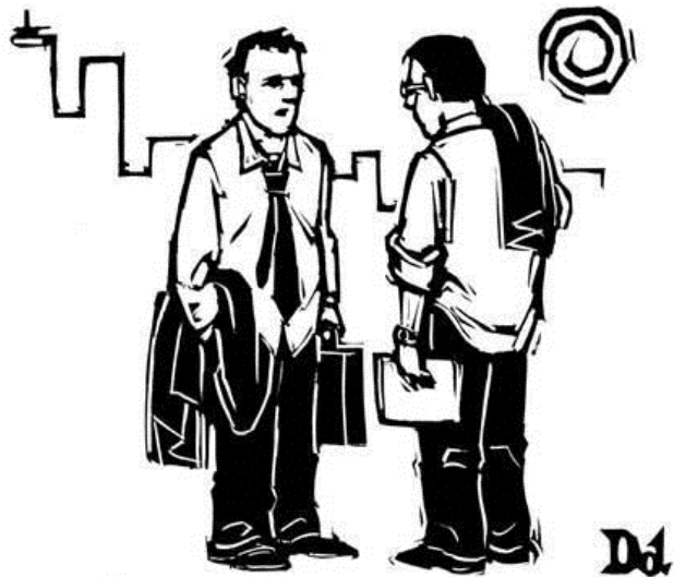
"This heat is killing me. Let's get a drink in Little Antarctica?"