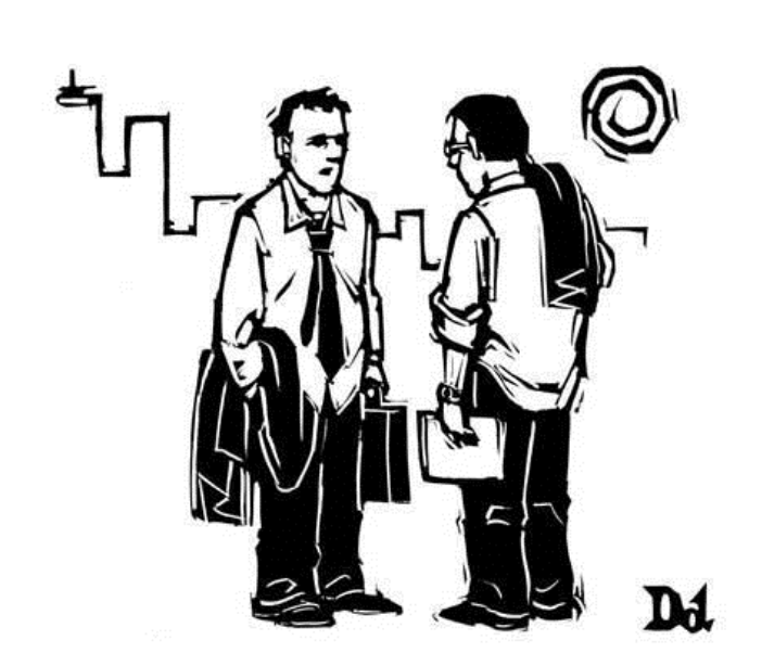
"This heat is killing me. Let's get a drink in Little Antarctica?"