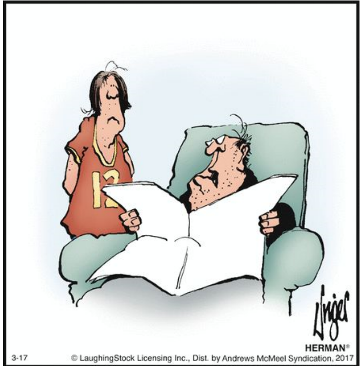
“One day you’ll realize that the people most capable of running the country are too smart to get into politics.”