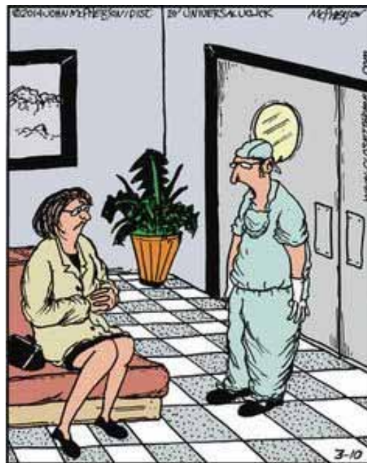
“The whole surgical team worked really hard on him, but we reached a point where it was really gross-looking, so we quit.”