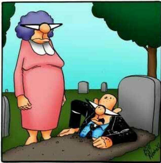
“It would be nice if you could check for a pulse next time.”