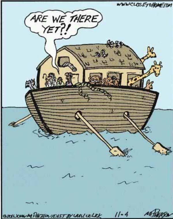
The famous question is asked for the first time.