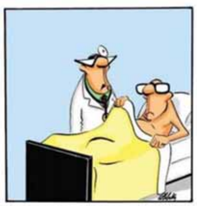
"The small neat scar was from the surgery. The long jagged scar is where I sneezed."