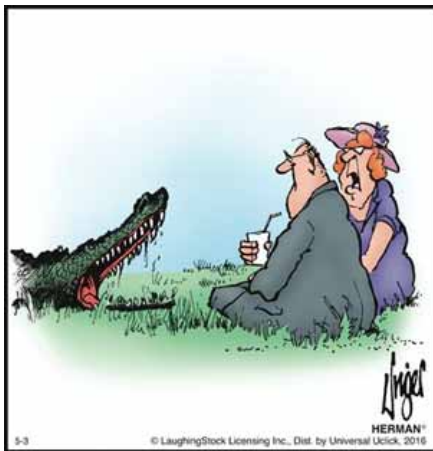
"It'll go away if you don't keep looking at it."