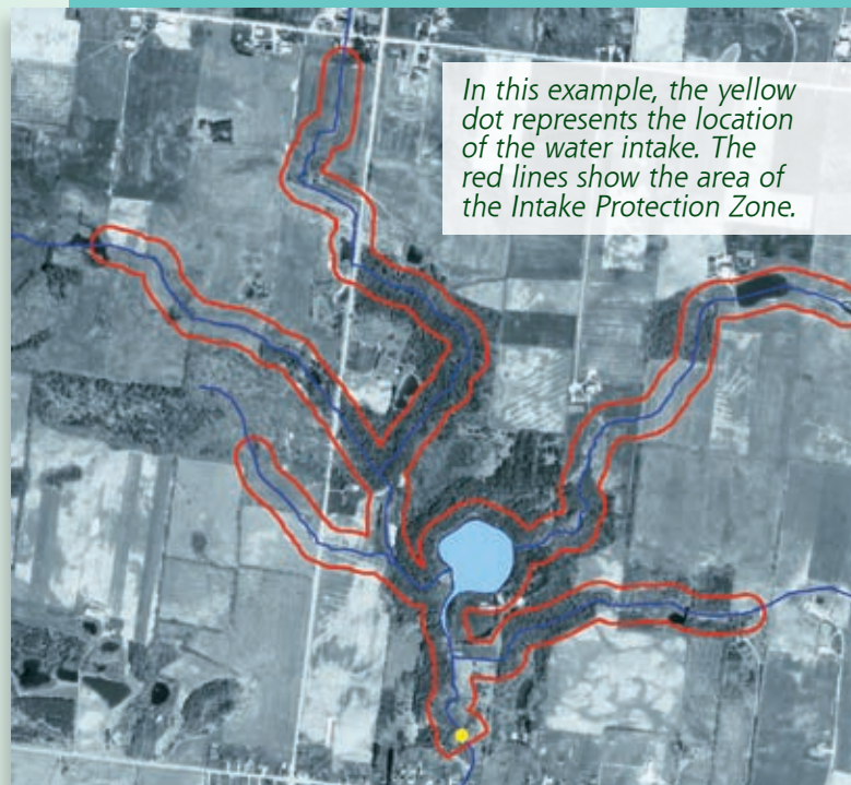
In this example, the yellow dot represents the location of the water intake. The red lines show the area of the Intake Protection Zone.

The area of water and land within an intake protection zone is determined by a variety of factors such as the amount of time it would take any material spilled in or near the river to flow downstream to the water intake. This is called the time of travel . A fast or slow flowing river can change the area of an intake protection zone significantly. Under the Clean Water Act, 2006 the province has required that several intake protection zones be identified: one for the area immediately adjacent to the intake; one for the area further upstream where a spill might reach the intake before the plant operator can deal with it; and a third that includes a larger part of the watershed. For the purposes of establishing the second intake protection zone , technical staff examine a minimum time of travel of two hours, although it could be longer if the water treatment plant operator response time is longer. River flows, streams feeding into the river or lake, and the location of municipal storm sewers or rural drains are all considered when determining an intake protection zone since they all affect time of travel .