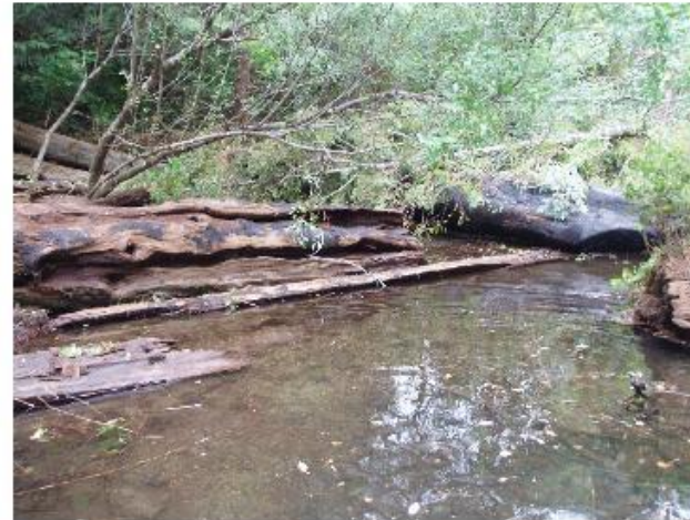
8.) Jam 54- 4+722 m after.