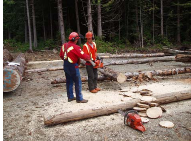
Figure 6.) Practical component of the Basic Chainsaw Operators Course

The afternoon of August 8 th was also devoted to a pre-work orientation reviewing safety regulations, procedures and guidelines. Specifically, Emergency Transportation Procedures, Significant Environmental Aspects, Standard Operating Procedures (SOP's), Job Safety Breakdown, and helicopter safety procedures were discussed. In addition, the WCB requirements for safety gear (hard hats, caulk boots, chaps, high visibility vests and whistles), fire tools, and on-site First Aid equipment were reviewed. Laminated handouts containing information on Emergency Transportation Procedures, SOP's, and example diagrams of in-stream log structures from Slaney and Zaldokas (1997) were given to each crew member.