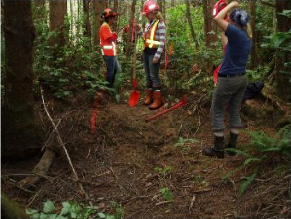
13.) Sidechannel - before.