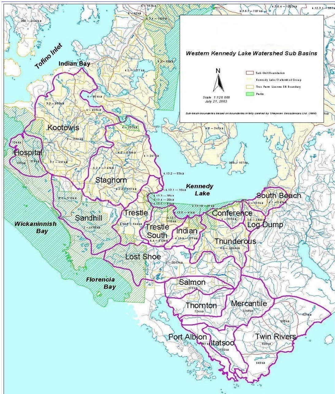
Figure 3.) Kennedy Flats project area and adjacent sub-basins.

Kennedy Flats is located in Clayoquot Sound on the west coast of Vancouver Island. It is Watershed #249 under the Ministry of Environment, Lands and Parks' 2002-2003 Resource Management Plan (MoELP 2003). Most of the area is provincial crown land (Figure 3).