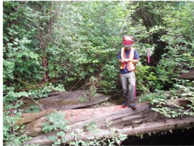
11.) Jam 56 - 4+813m before.