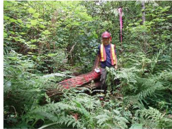
3.) Jam 52 - 4+682m before.