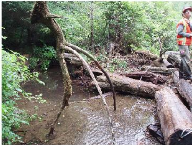
10.) Jam 55 - 4+795m after.