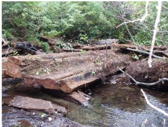
2.) Jam 51 - 4+635m after.