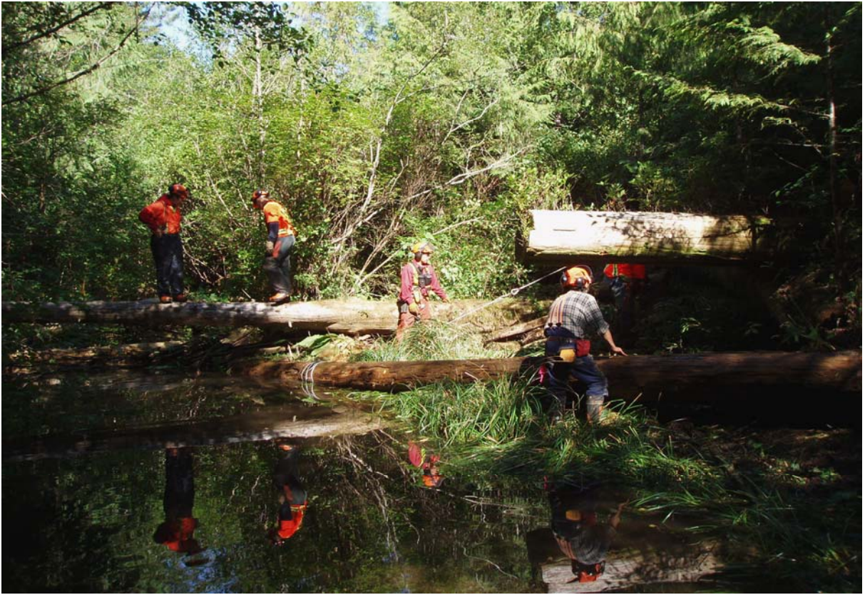
Figure 7.) Repositioning LWD to provide cover and scour.

LWD was re-oriented where necessary using peaveys, pike poles, turfing, and chainsaw winches; and cabled into place using galvanized steel cable (3/8–5/8” in diameter). Holes for the cable were drilled in the logs using gas-powered augers. Where drilling was not feasible, notching, staples, Crosby-clamps and multiple wraps were used to secure the cable. See Appendix VI for photos of restoration techniques and operational procedures. Ballast rocks and standing dead trees and stumps were used as anchors. Live trees were used as anchors only where no other options existed.