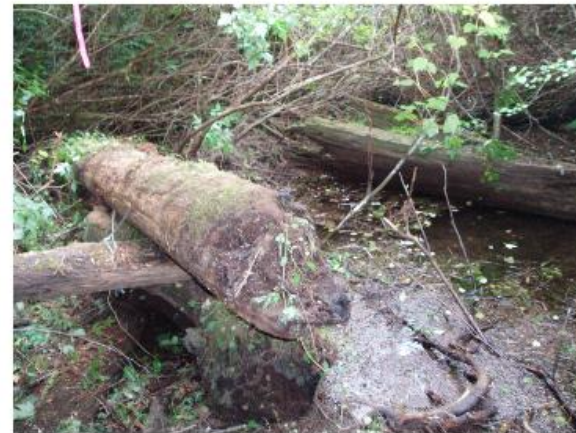
4.) Jam 52 - 4+682m after.