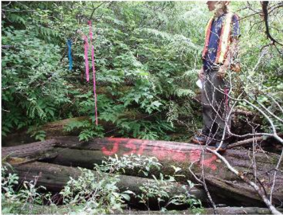
1.) Jam 51- 4+635m before.