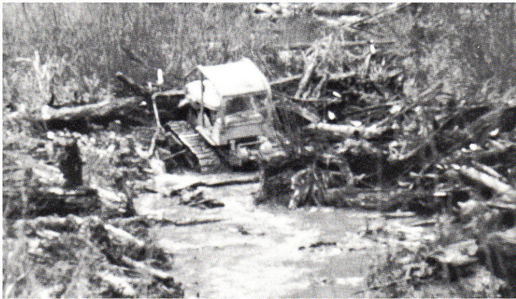
Figure 2.) Stream Cleaning with Bulldozer, 1971.

Although current timber harvesting regulations in British Columbia (BC), Canada require reserve zones of riparian vegetation adjacent to fish-bearing streams, this was not always the case. Before the introduction of the Coastal Fisheries/Forestry Guidelines in 1988, and the Forest Practices Code in 1995, most riparian areas were logged to the stream edge. Also starting in 1995, the Clayoquot Sound Scientific Panel recommendations required additional stream protection practices. Historical harvesting practices such as cross-stream yarding and the removal of riparian vegetation and trees have negatively impacted riparian ecosystems and stream function (Figure 1). Declining salmonid populations are commonly associated with this type of habitat degradation (Frissell, 1993). In recent years, considerable efforts have been made to rehabilitate damaged streams and riparian ecosystems in coastal BC.