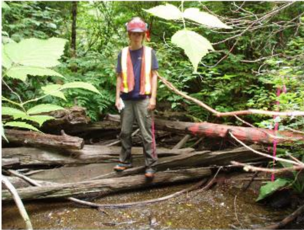
9.) Jam 55 - 4+795m before.