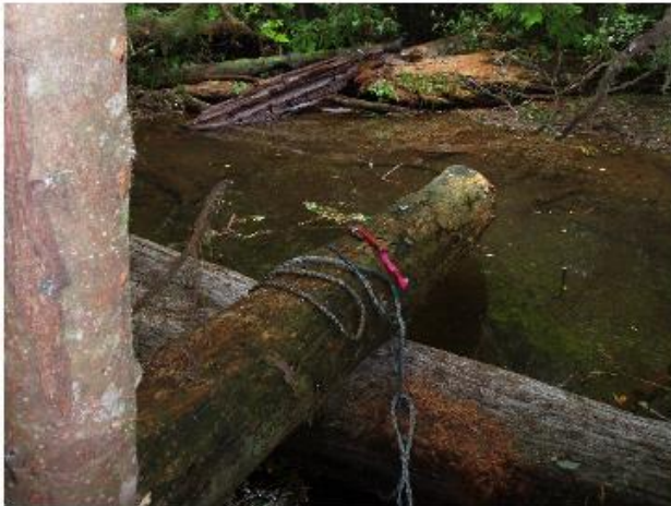
6.) Jam 53 - 4+717m after.