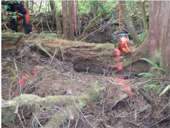
15.) Sidechannel - before.