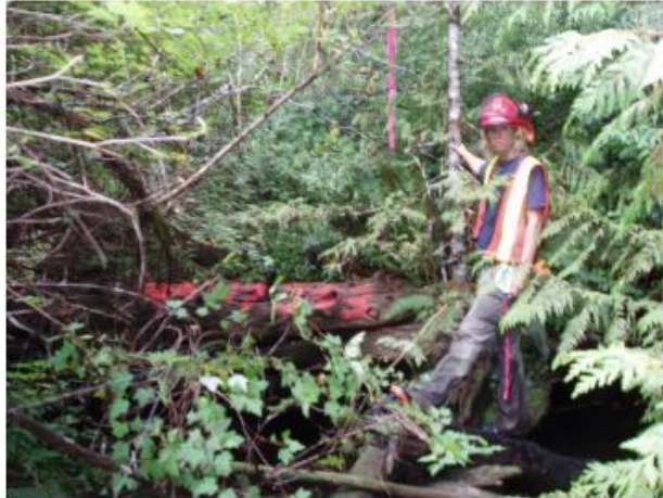
5.) Jam 53 - 4+717m before.