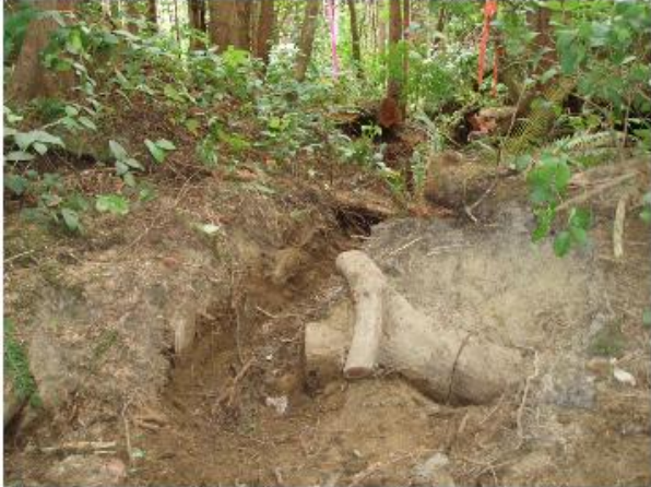
14.) Sidechannel - after.