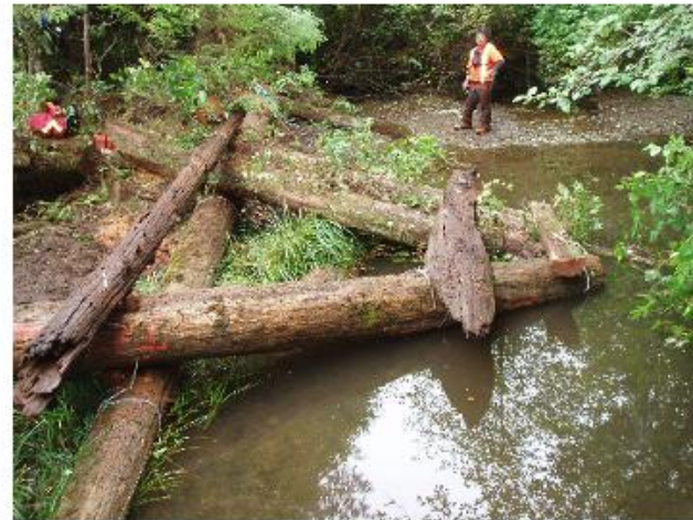
12.) Jam 56 - 4+813m after.