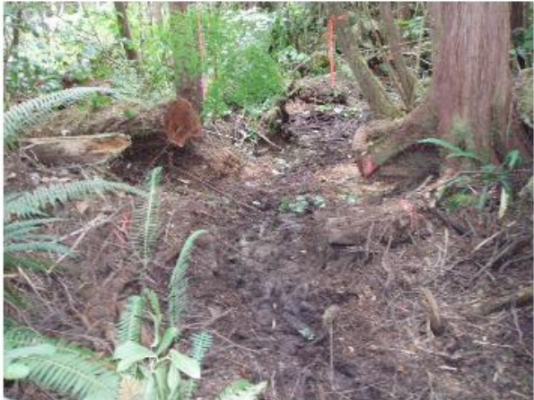
16.) Sidechannel - after.