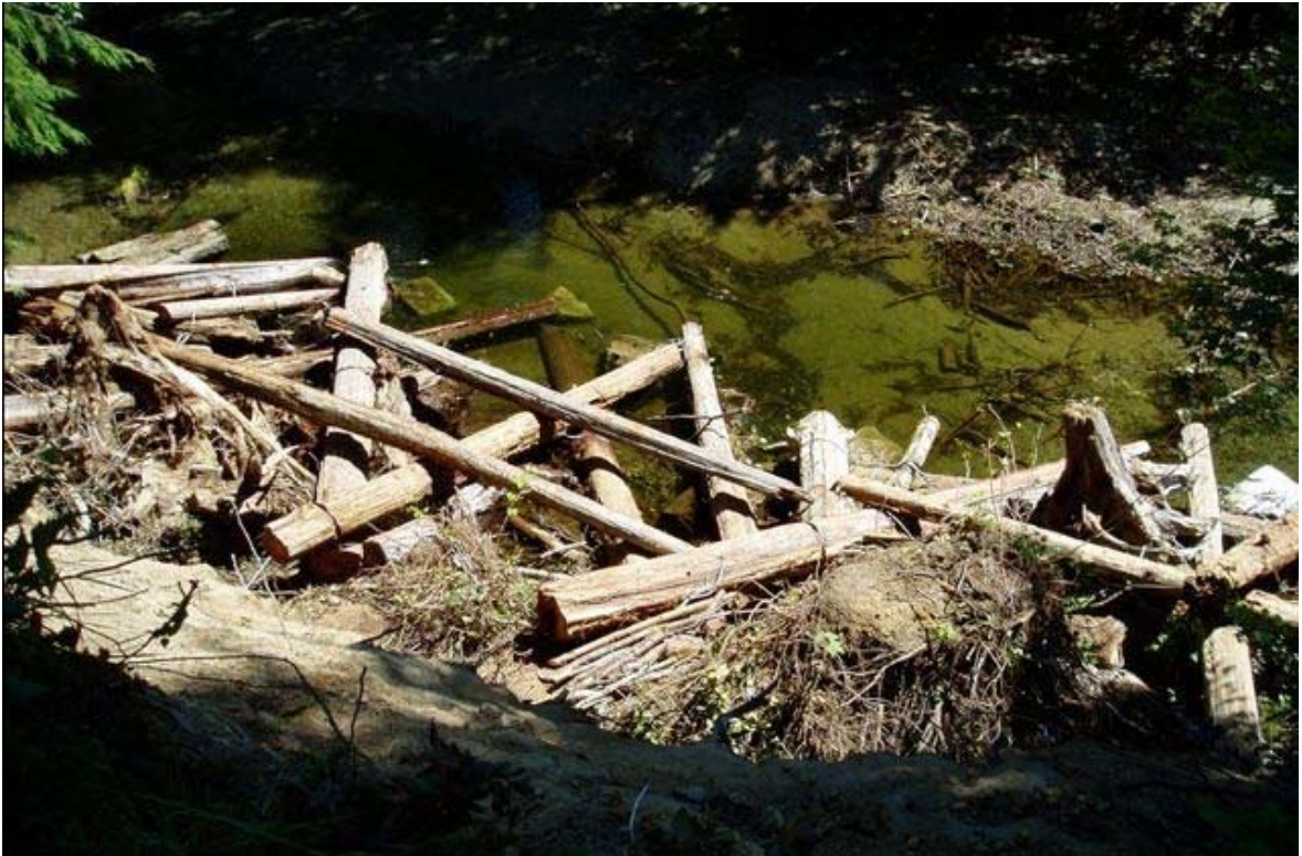
Figure 5.) LWD spurs at Lost Shoe Creek provide cover and erosion protection.

Scour is a beneficial function within the creek system as it is a means of creating pools and undercut banks. It is also an important factor in defining the thalweg (the line of deepest water in a stream channel as seen from above), improving water quality through aeration, and maintaining spawning habitat through the flushing of fine sediment and organics. Scour can be enhanced through the construction of structures which influence the direction of flow, such as boulders, weirs, and A-frame spurs. Both cover and scour objectives can be addressed by the same in-stream structure (Figure 5).