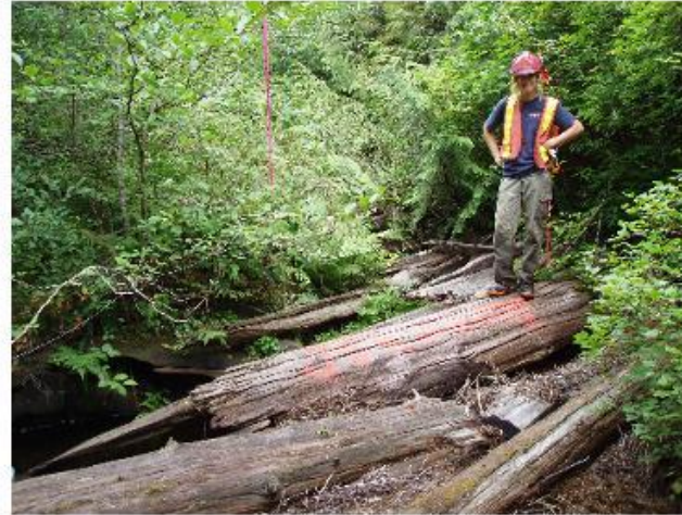
7.) Jam 54 - 4+722m before.