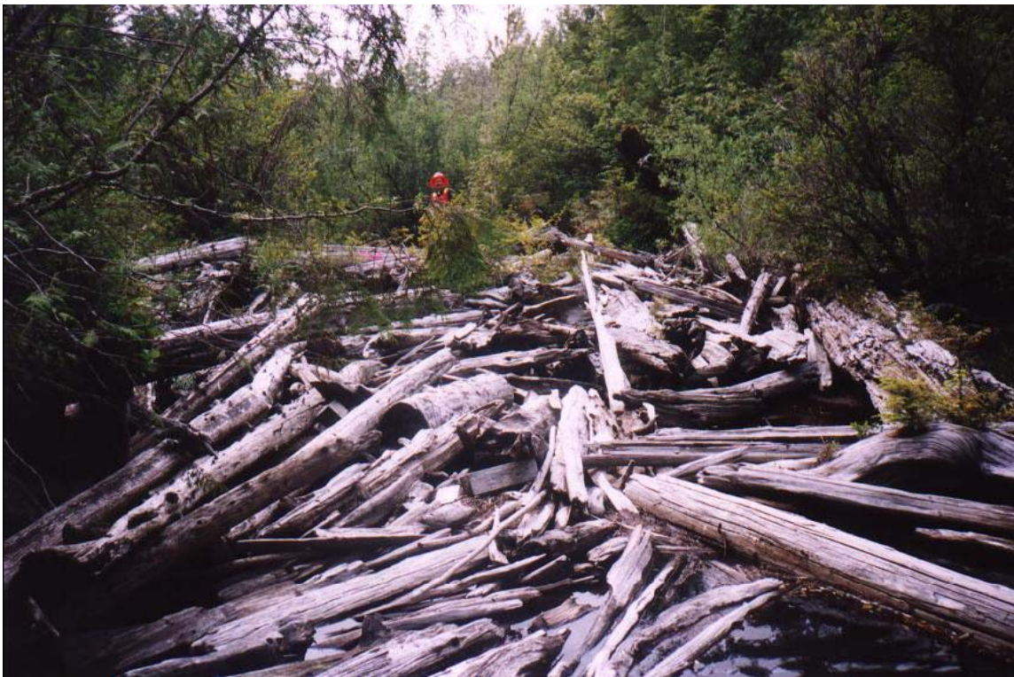
Figure 4.) Debris Jam in Lost Shoe Creek.

Much of the Kennedy Watershed was logged between 1950 and 1980. Early logging practices often involved cross-stream yarding, the use of under-sized wood-box culverts, and poorly built roads. After harvest, large amounts of both small and large woody debris (LWD) were left in-stream. Subsequent salvage logging for shake and shingle added to the problem, introducing large amounts of residual waste small woody debris (SWD) into the streams. When combined with large downed logs that span the width of the stream, the SWD often results in debris jams (Figure 4). These jams restrict water flow within the stream, and lead to flooding in the surrounding riparian forest, reduced scouring ability, and poorer water quality (Warttig et al., 2001).