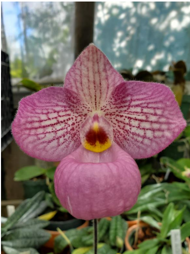
Lorences' Magic Lantern above Hawaiian wedding Song below