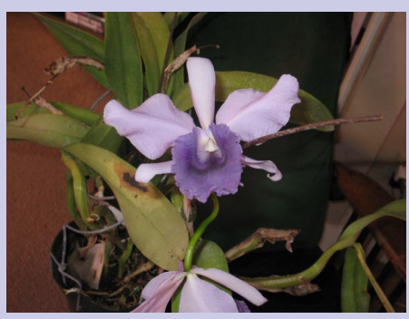
Rhyncattleanthe Blue Beard