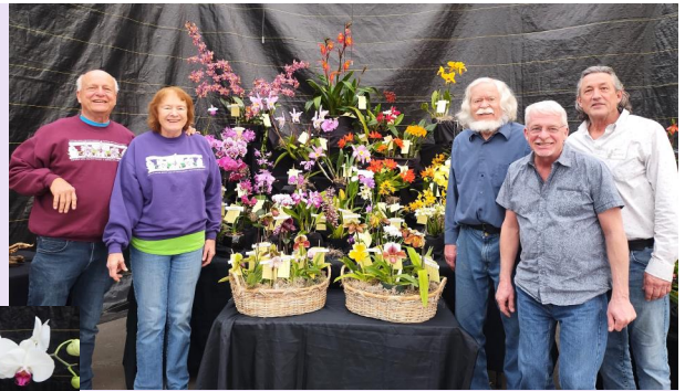
Onc. John Miller 'Kimberlyn Helen' AM/AOS and Lc. Puppy Love far right, Phrag. QF Tower middle and Doc Bannister's Best Phal Star April's Coming