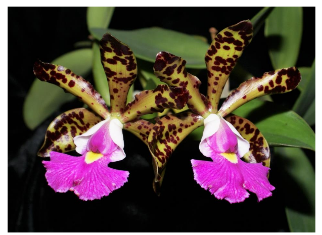
20182148 C Peckhaviensis 'Joan's Surprise' AM 81pts: Joan Goodman from Illinois OS

Nearly 20 plants were pulled by the judges for consideration of AOS awards and a total of 7 were given. The Eastern Iowa Exhibit in the round on page 1 received the AOS show trophy for the best display in the show and also was chosen for the People's Choice Award by those attending the show. The photos here show the awarded orchids.