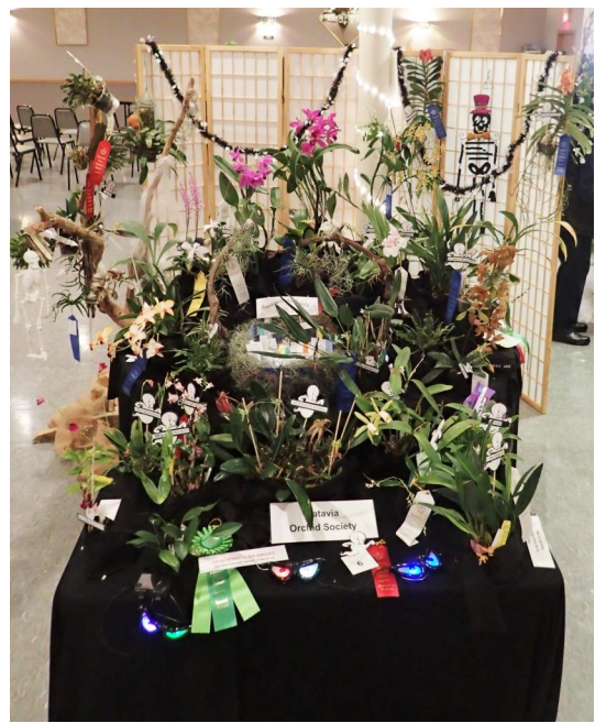
Batavia Display winner of the 'Spooktacular Award' for best thematic display