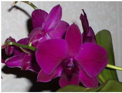
From Bill Snyder : No name Dendrobium from Farm and Fleet (right)