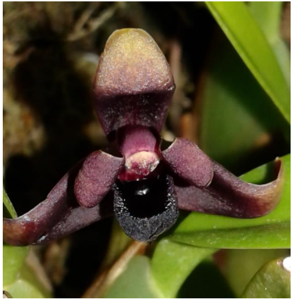
From Bill Englert : Masd. Aquarius (left); Oncidopsis Living Fire 'Glowing Embers' HCC/AOS (Middle); Maxillaria variabilis (top)