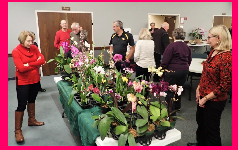
WHICH ONE DO I CHOOSE, WHICH ONE DO I CHOOSE? OH, I HOPE SHE DOESN'T TAKE THAT ONE!