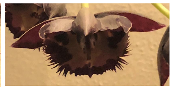
#2. Ctsm. Diana's Dots (Orchidglade 'Davie Ranches', AM/AOS x tigrinum 'SVO'): six flowers on one inflorescence. All measurements: NS: 6.1 x 4.2cm, DS: 1.0 x 3.2, Congrats Andy C-B!

Judging: In looking at the AOS awards for this cross, there are 5: 4 AM and 1 high HCC. Judges seem to like this cross. The average # of flowers is 9.6 and ours only has 6. The range of average Natural Spread is 5.2-8.0 that is quite variable. Ours is 6.1. Ours is quite within the size range of awardability. I looked for awards that closely matched our photos. I personally love that spatulate lip with a pattern that shows off those spots. The white appears white, and the maroon is clear. Looking at comparison awards, 'Yosemite Sam' and 'Tabasco,' both AMs, the color is pretty much the same as ours. Clearly if you look at Ctsm. tigrinum, the form is all Orchidglade as is the flower count. Orchidglade has the wide spatulate, dentate, fringed lip, as opposed to tigrinum. It has an odd shape and really does not lend much to the form of Diana's Dots. Many of the awards have a yellow base, from the tigrinum. But ours clearly is more Orchidglade. The awards all seem to have heavy substance and texture. The contrasting color on the petals is striking. (It appears as though these are tiny ridges, but looking closely, it appears as if it is the white coming through). For me, the number of flowers is low. The size of the flower is within a low awardable range, and the lip is flat and balanced, leading the form points. I likely would give this around a 76-78 point HCC.