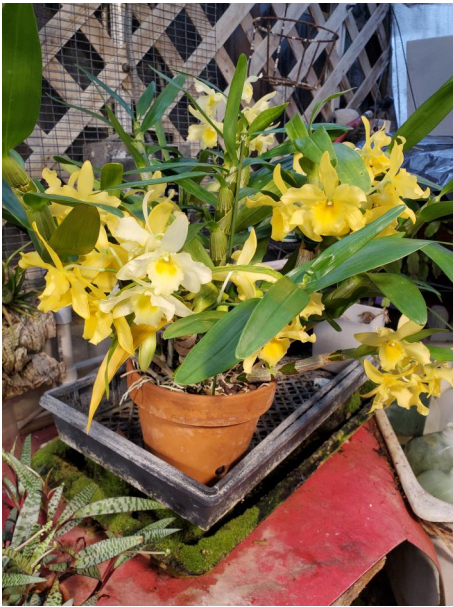
Dendrobium Yellow Song 'Canary' - interestingly a couple white flowers as well. Jon Lorence