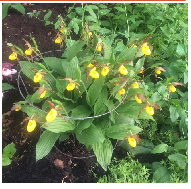
Cyp parviflo-rum above and Cyp . Gisela ( parviflorum x macran-thos ) on left.