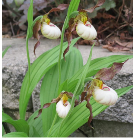
Marcia Whitmore sent these pictures of her clump of Cyp. x andrewsii (natural hybrid between parviflorum and candidum ). Beautiful large flowers.