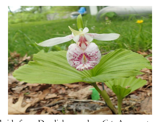
Hybrids from Dusdieker garden: Cyp. Annegret (parviflorum var. makasin x shanxiense) left: Cyp. x ventricosum (calceolus x macranthos) right;

Cyp. x ventricosum (calceolus x macranthos) right, and the Chinese species Cyp. formosanum above.