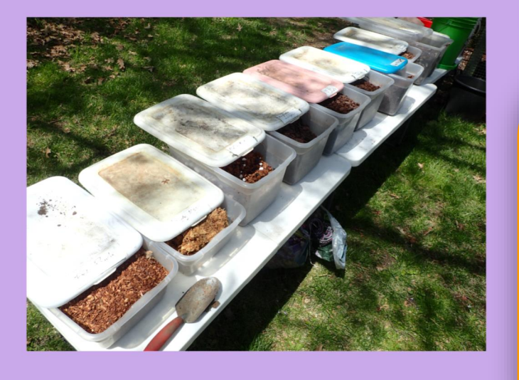
Our May Orchid Repotting Party!