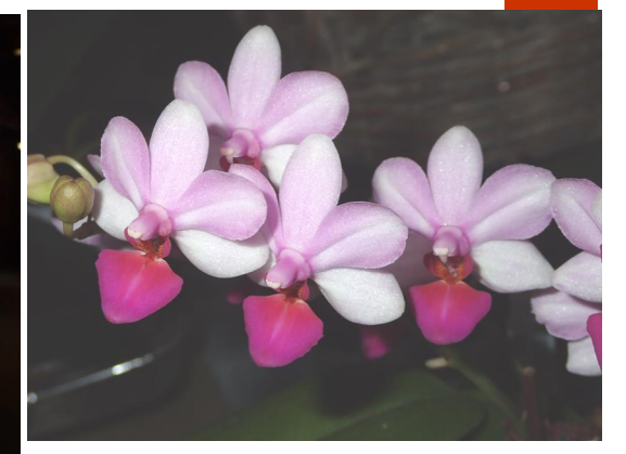
LEFT: Two miniature phalaenopsis: Liu's Cute Angel 'KF#3' AM/AOS and ABOVE: Liu's Berry 'Orchid House' AM/AOS. Both are new miniature breeding from Phal. pulcherrima plus the addition of Phal. lobbi and Phal parishii in the mix. Both were sale plants at the Noelridge Showcases.