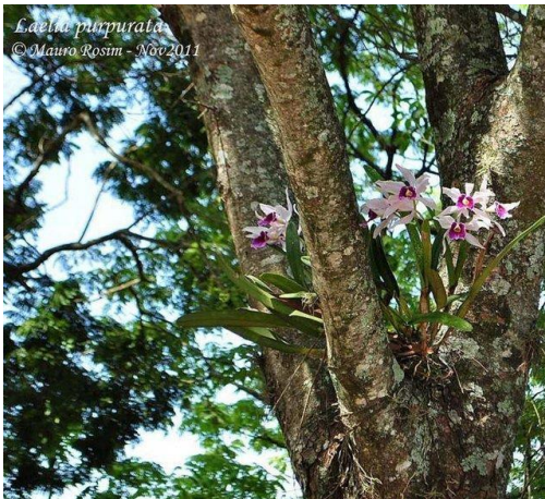
C. purpurata blooming insitu, Below habitat and tree with moss and plants from our trip to Brazil in 2015. NILE