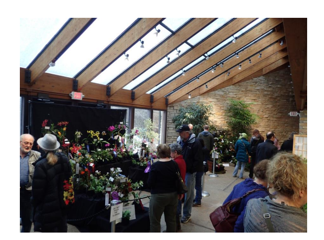
Above-the display room at Olbricht Botanical Gardens and the 'pinks' at the center of our display. Below-Set up crew, our white collection and what a frosted paph looks like!