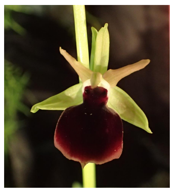
BUZZ BUZZ! This is the bee orchid blooming in Iowa! Ophrys sphegodes , native to Greece

Web Page Editor: Nile Dusdieker (319) 626 2236 E-mail: niledusdieker@gmail.com