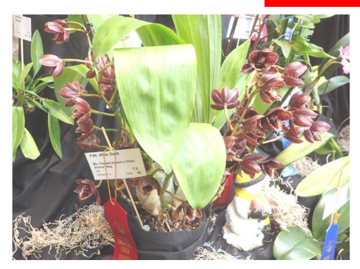
Fredclarkeara After Dark ( Mormodia Painted Desert x Catasetum Donna Wise) 2nd at Madison, 3rd at Batavia