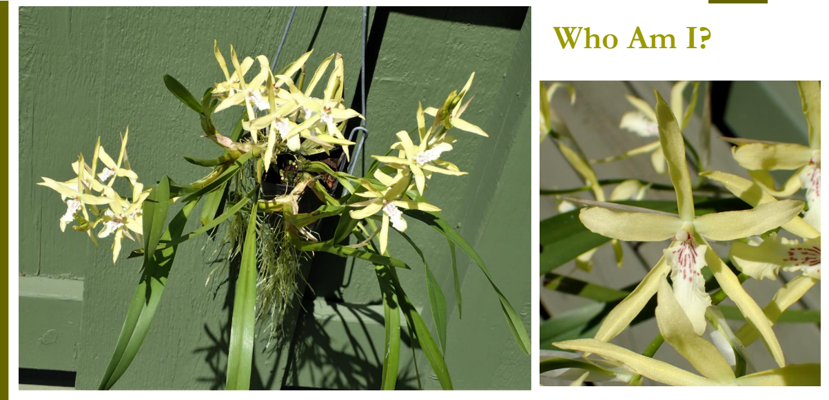
GENUS : a – Epidendrum , b – Encyclia , c – Oncidium , d – Miltonia , e – Paphiopedalum (demerits if you select this one!)