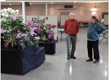
Setup is a BLAST!